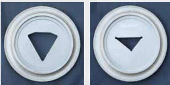
Gem Diamond Arbor for use on Soff-Cut™ Saws

NOTE: GEM DIAMOND ARBOR FITS SOFF-CUT™ MACHINES AND Z-TRIANGLE ARBOR FITS CARDINAL MACHINES